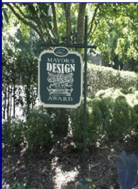
Mayor's Design Award

The Planning Department, City Council and Architectural Review Team are very excited to offer these signs and look forward to acknowledging all of the hard work and dedication which developers and residents put forth in the City of Columbia.