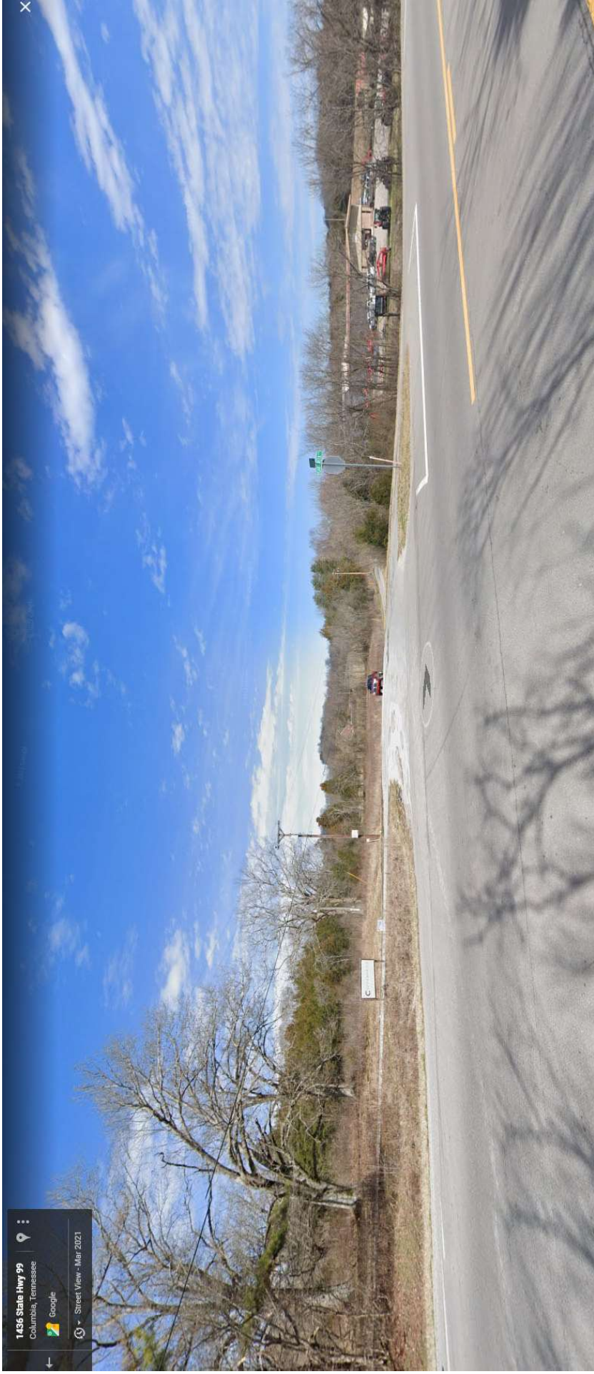
INTERSECTION OF LASEA ROAD AND BEAR CREEK PIKE (LOOKING NORTH)